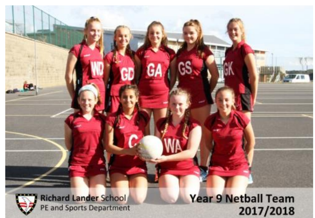
Richard Lander School PE and Sports Department Year 9 Netball Team 2017/2018