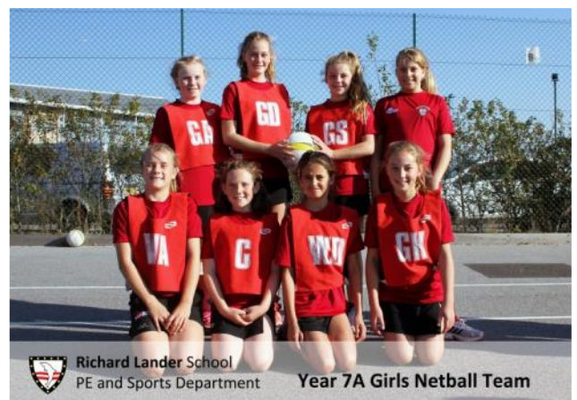
Richard Lander School PE and Sports Department Year 7A Girls Netball Team