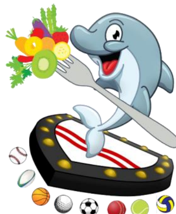
RLS Health Matters

Why not try one of the many and varied PE lunchtime clubs. There is something for everyone. The timetable for these activities can be found on Moodle and on the PE noticeboards or in the last bulletin