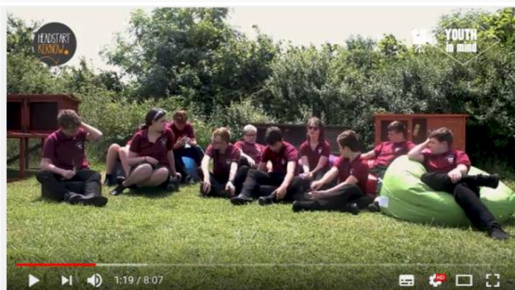
Youth In Mind - We're Not Different, We're Like You