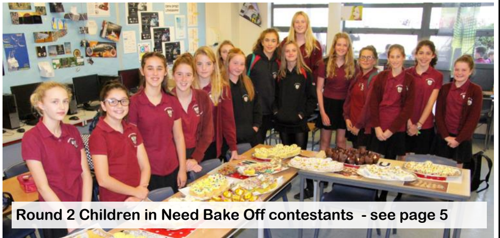
Round 2 Children in Need Bake Off contestants - see page 5

Thursday 20th December - end of term, back on Monday 7th January!