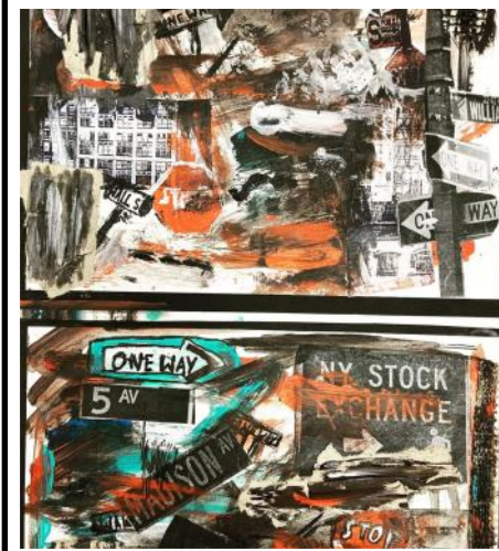
Great mixed media work by Tegen #gcseart #gcseartwork #mixedmediaart