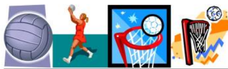
Learning Community Netball Results - December, 2022

At the end of last term hundreds of students from across years 7-10 took part in Learning Community Rugby and Netball . As you can see from these tables, competitions were closely fought with Godrevy and Towan finishing in joint first place in the Netball and Towan finishing first in the Rugby, closely followed by Godrevy. There is still everything to play for, for all learning communities though, with other competitions this term and next term culminating in Sports Day. Well done to all the students who took part.