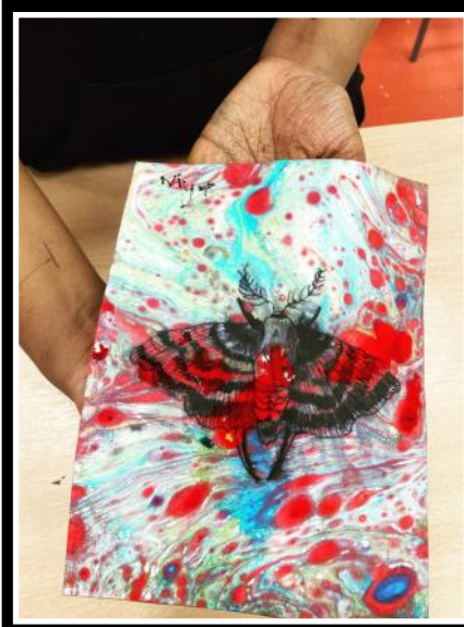
Niya created a wonderful marbled insect at Art Club last night!