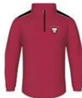
Unisex 1/ Zip Top £25

NB. Whilst the shorts are proposed to be a compulsory item in the PE kit, students will be given the opportunity to wear plain black, full length unbranded leggings in PE instead of this.