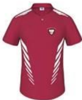
Unisex PE Top £26.50