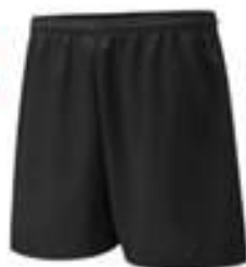
Unisex PE Shorts £10