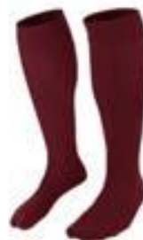
Unisex PE Socks £4.50