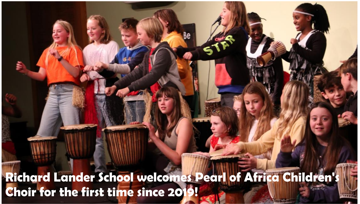
Richard Lander School welcomes Pearl of Africa Children's Choir for the first time since 2019!

In the latest exciting episode of our wonderful friendship with our Ugandan partner schools, we have been absolutely delighted to welcome the Pearl of Africa Children's Choir* back to Cornwall for the first time since 2019!